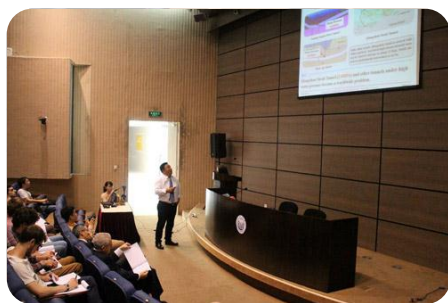
Training event in Shanghai, October 2015.

aspects in collaboration with the requesting nation.