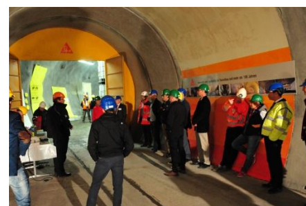
Demonstrations in the Hagerbach Test Gallery

During the discussions, operation and maintenance issues were discussed. A follow up Deminar on the topic "Life cycle management of tunnel installations", which addresses these issues, is scheduled for September 2016. A first draft of the programme will shortly be available on www.hagerbach.ch .