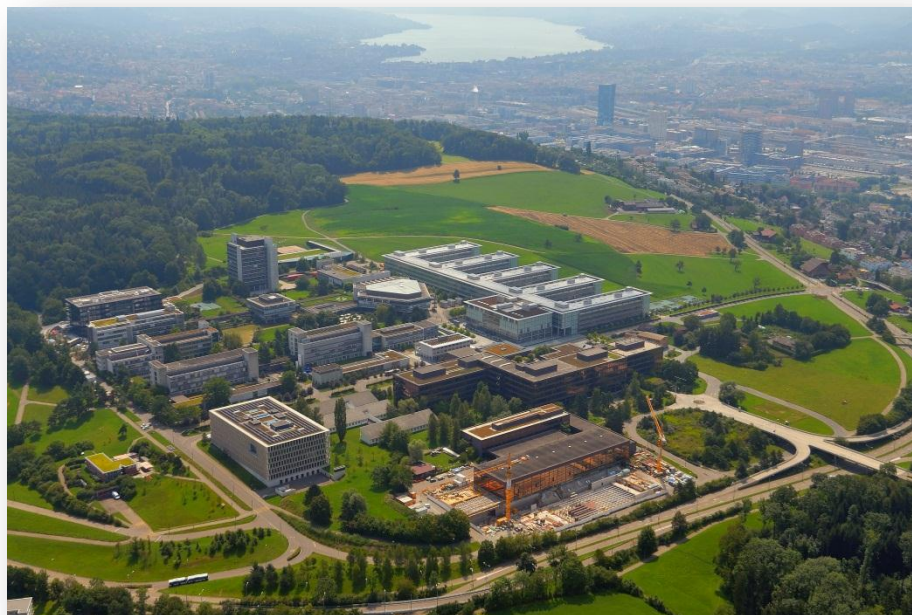
The Hönggerberg campus, Zurich.

The Steering Board went on to study the feedback from the training events held in Mexico, Switzerland and Argentina. This feedback is globally positive and the knowledge and experience of the lecturers is particularly appreciated. Comments on any weaknesses of the training events often lack precision. It was therefore decided to revise the feedback form in order to obtain more detailed and precise information. This should help to further improve future events.